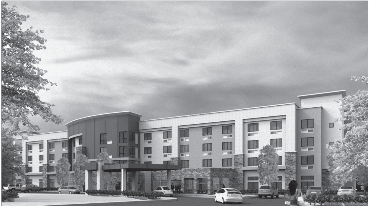
An artist's rendering of the future 120-room hotel to be built by a New Mexico developer on 2.7 acres of land adjacent to the Las Cruces Convention Center.

"The university had an obligation to the city," Eschenbrenner said. "We told them we would put a hotel on that land when we leased the land for the convention center."